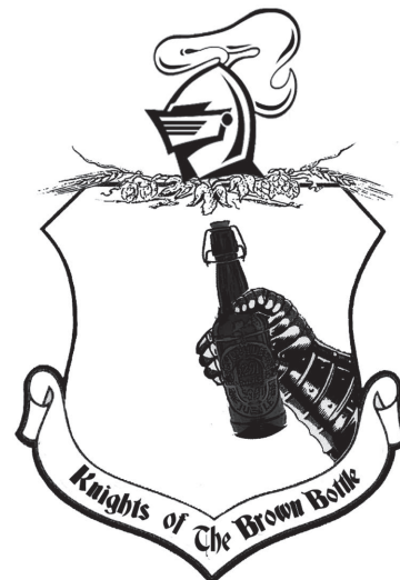
Line art version of the Coat of Arms (larger version appears on back cover of this issue)