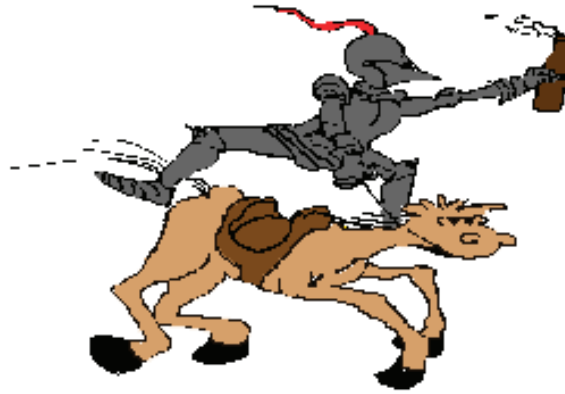
The Drunk Knight rode for many years through the 90s