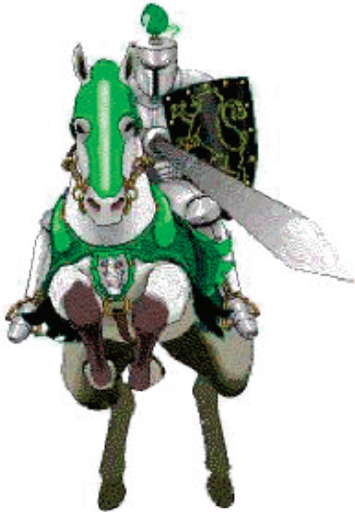
The Sword bearing Knight has been quite popular, and still appears in various club pubs.