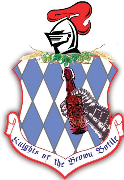
Our Current Coat of Arms, sporting Oktoberfest background