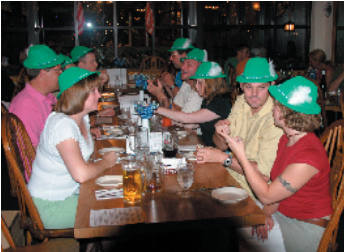
Tyrolean Hats were de rigneur!