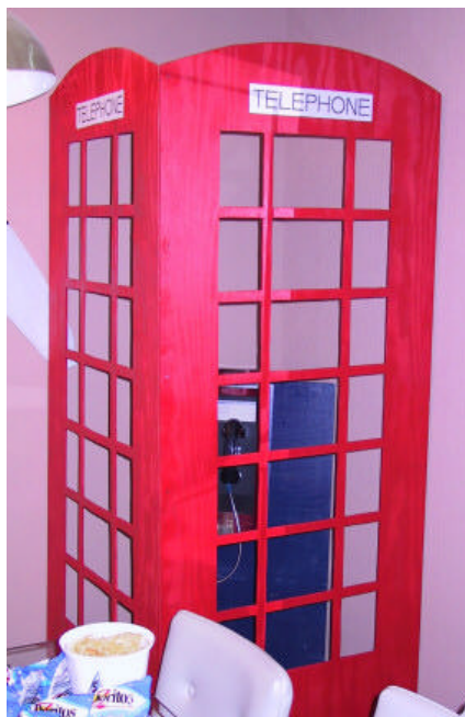
British Phone Booth in NTHBA Club Room

(Continued from page 1) already have your entries, there's just enough time to brew a beer for the Sunshine Challenge (May 6 is the entry deadline). And while we may seem to have a lot of time until the Dixie Cup (October), let's not sit back and wait until the last minute to start brewing. Let's go to Houston and take the Dixie Cup!