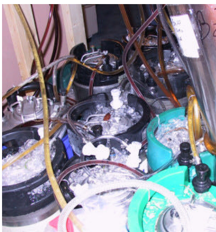
Lots O' Kegs

I wish to thank all of the participants and the members of the 2 winning clubs for their participation, and their patience, while we ran through all of the numbers. In addition, I will request that the committee have a second stein presented to the NTHBA for the "keeper" trophy and that the engraving show both clubs on the stein base as winners. I would like