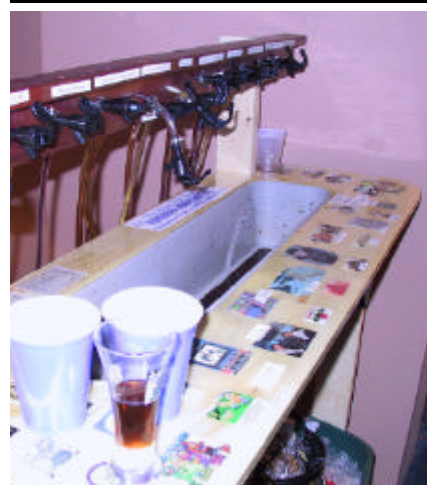
Lots O' Taps

to see the Foam Rangers keep the travelling stein this year. All of us would like to see it returned to the event, and be placed on the rostrum, during the Friday nite welcoming ceremony in 2003.